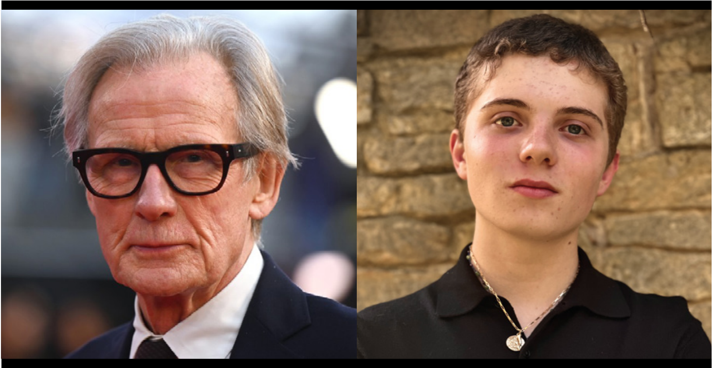
Picture given for guidance only. For internal use – not for distribution. Credits are not contractual.